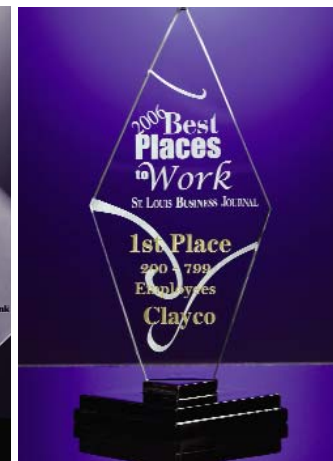
St. Louis Business Journal - Best Places To Work Award - 1st Place, Clayco, Inc.