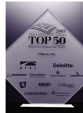
Greater St. Louis Top 50 Businesses Shaping Our Future

Creativity • Courage • Mentor Teamwork • Adaptability • Stamina (work with a smile) • Results • Sense of Urgency